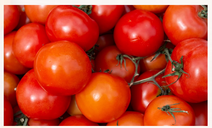
Using duties to replace the suspension agreement that regulates U.S. imports of Mexican tomatoes would make things far worse for the U.S. tomato market, says Javier Badillo of the FPAA in this guest column.

By imposing a minimum price, the suspension agreement ensures that U.S.-grown tomatoes can compete with Mexican imports. However, without the suspension agreement, there would be no minimum prices and U.S. market prices will be far more volatile with sharper price swings. Tomatoes are perishable, seasonal and regional, making them highly sensitive to rapidly changing supply and demand conditions. Duties imposed on Mexican tomatoes will increase their prices but won't prevent market price volatility like a minimum price does.