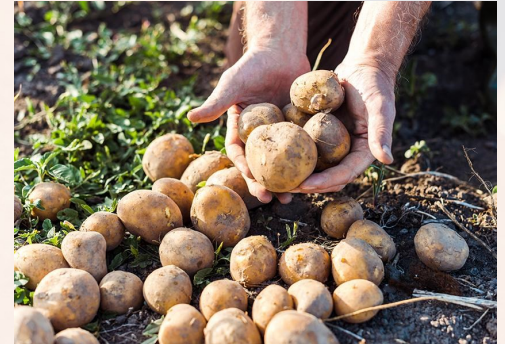
At 941,000 acres, the 2024 U.S. potato planted acreage forecast is a 24,000-acre reduction from 2023 but is 18,000 acres more than the 2020-22 average, according to the USDA.

Average yields in 2020-22 fell below trend largely due to weather-related issues in Idaho and Washington. USDA will release its preliminary 2024 U.S. and state-level potato yield and production volume in the November Crop Production report, which will include updated acreage estimates.