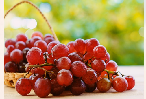
Chilean grape exports are projected higher for 2024-25.

The demand for new grape varieties further tightens profit margins, as renewing grape orchards requires a significant investment from producers, the report said. Table grape area planted in the Metropolitana region