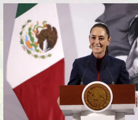
Claudia Sheinbaum Pardo, President of Mexico, speaking during a briefing conference at National Palace, on February 17, 2025 in Mexico City, Mexico.