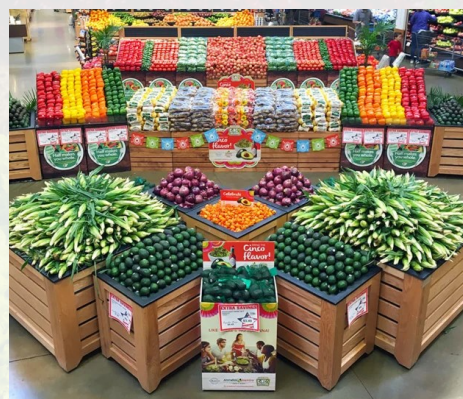
Retailers can use creative displays of Cinco de Mayo essentials to entice shoppers planning for festivities. Cross-merchandising and themed promotions also can help drive related sales.

Meeting the increased demand is imperative, and this year looks to have an outstanding season. Naturipe Farms says this year's avocado season is shaping up to be one of the best yet, with a strong supply driven by the growing impact of maturing avocado trees in Colombia.