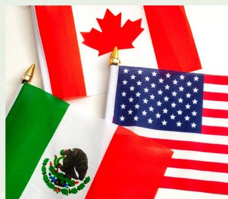
Canada, Mexico and United States of America flags

"We support holding trading partners accountable. Countries that would be ideal markets for U.S. apples shut us out due to non-tariff trade barriers," Bair said. "That's why USApple strongly supported the United States-Mexico-