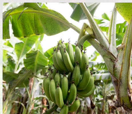
More than 400 million people rely on the banana for 15% to 27% of their daily calories.

"Climate change has been killing our crops. This means there is no income because we cannot sell anything. What is happening is that my plantation has